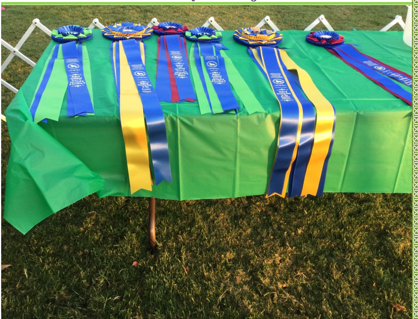
Ribbons at the Obedience & Rally Ring