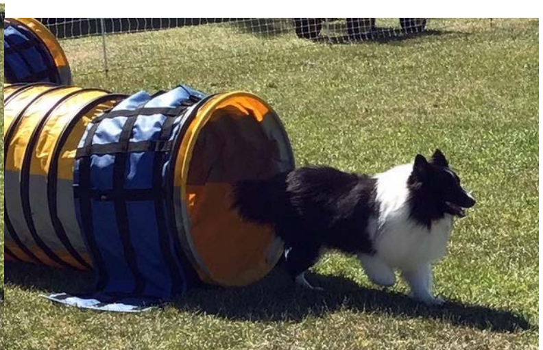
BRADY (First Agility Trial)