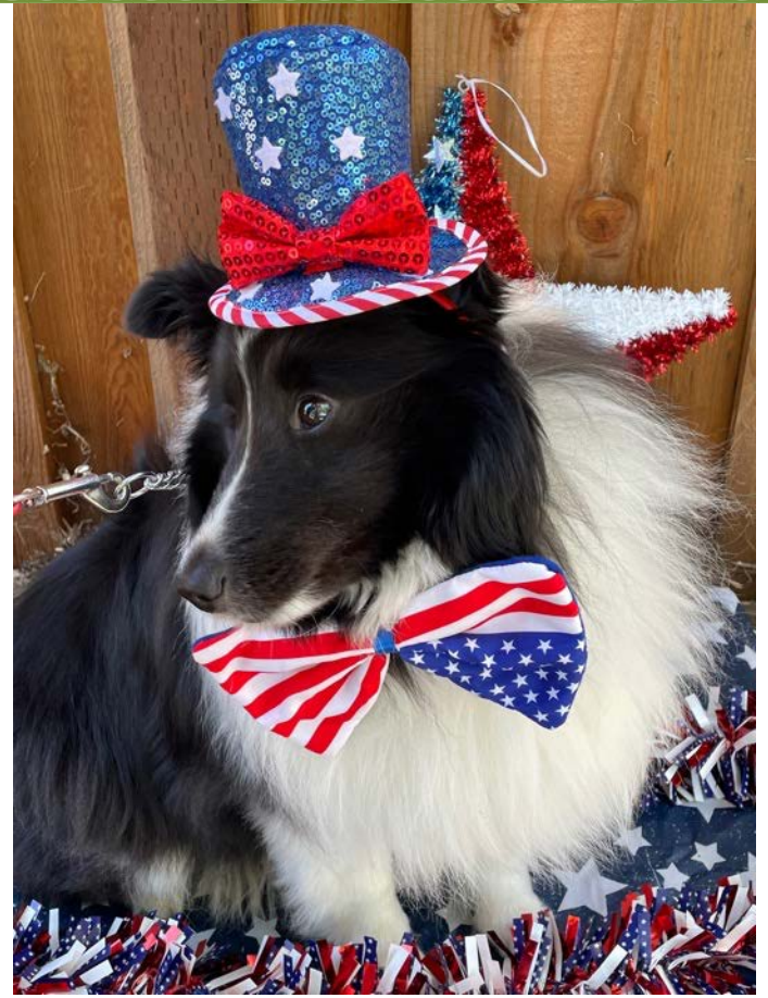
Brady (Phil Galu)