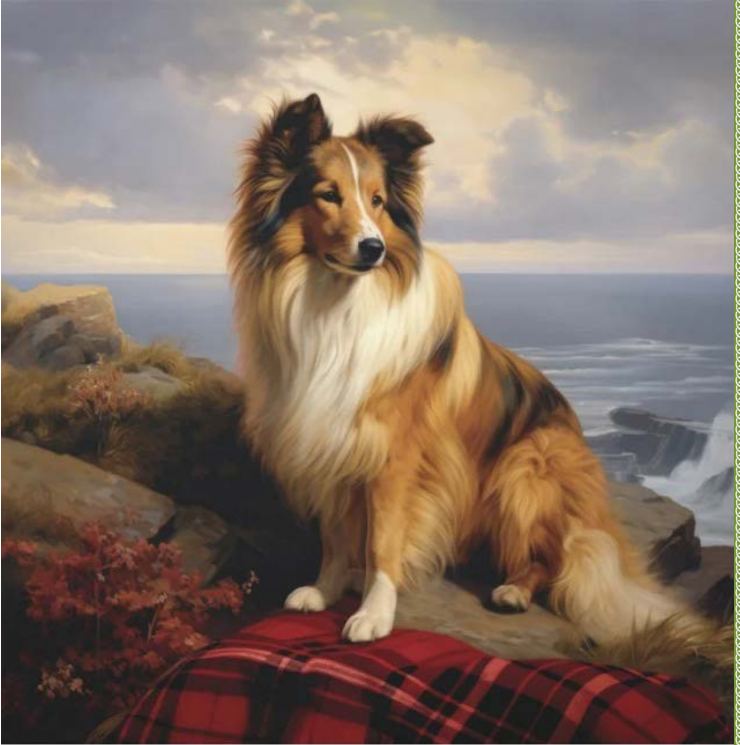
Wall Art by MacMichael Designs of Edinburgh