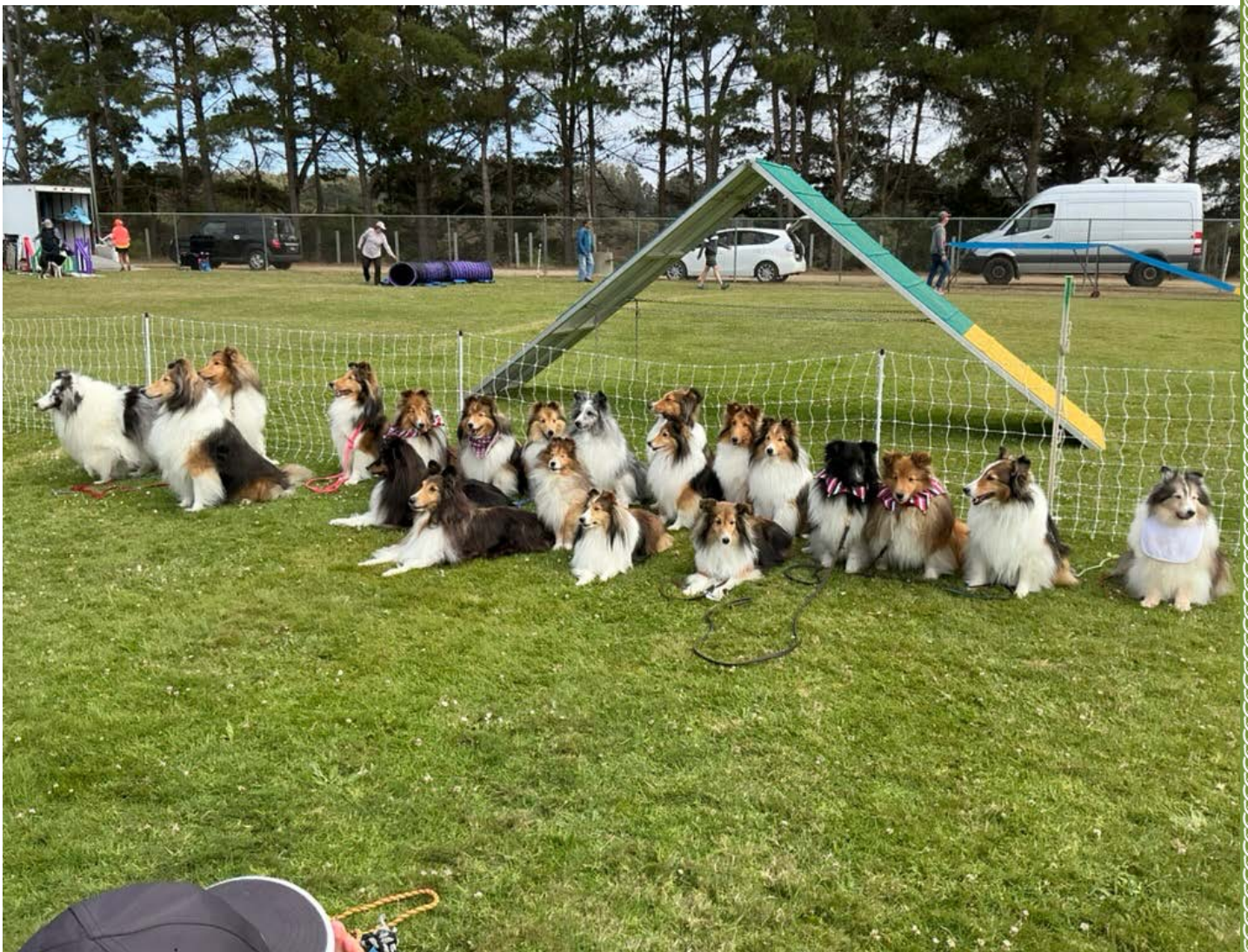
Group Photo of many of the shelties in attendance

Action photos will appear in the August Bulletin.