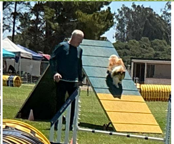
Action at the Teeter